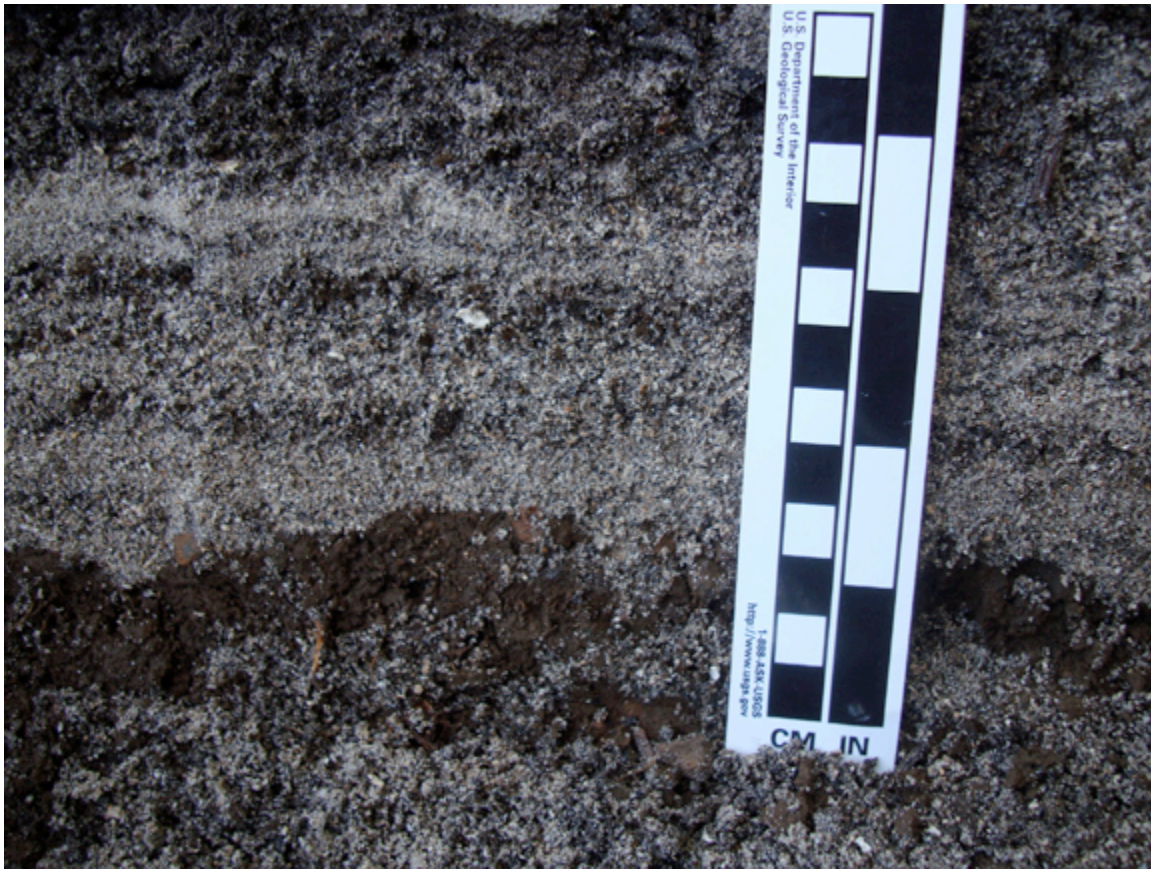
Figure 11. Close-up of a trench face near Satittoa Village approximately 250 m from the shoreline showing, from top to bottom: tsunami mud drape, multiple alternating light and dark layers of tsunami sand, and basal pre-tsunami soil surface.

2) Erosion at the shoreline was widespread and resulted in the transport of sediment and debris in both landward and seaward directions. The shoreline clearly provided sand and gravel (including revetment boulders) to the onshore sedimentary deposits. Maximum erosion of back beach areas, up to ~ 2m, appeared to be driven by offshore return flow of the tsunami in many localities as evidenced by offshore-directed flow indicators associated with major beach scarps.